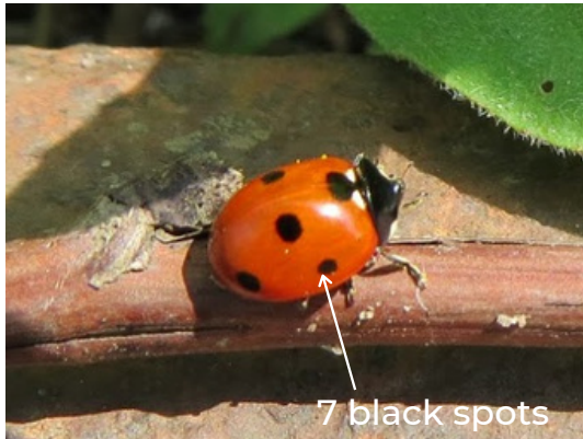
7 black spots