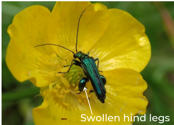
Swollen hind legs